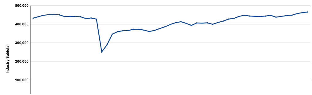
North Carolina Hospitality Employment